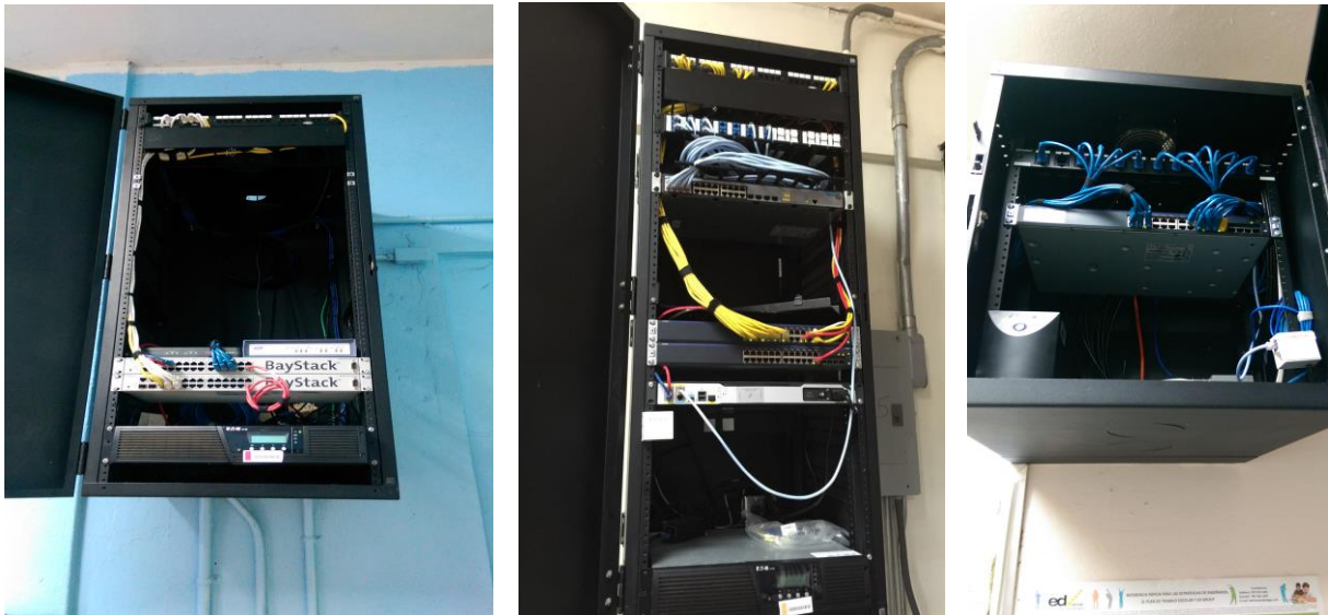
Diagram of typical PRDE School LAN.

[Remainder of page intentionally left blank.]